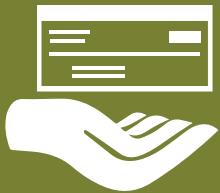
Inquiries & Reports